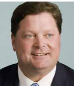
Joseph G. Blute Chair